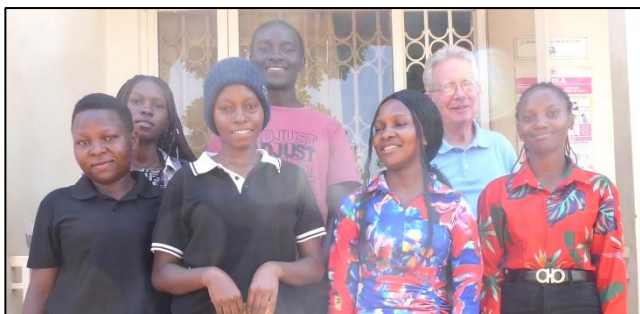
Our new university students